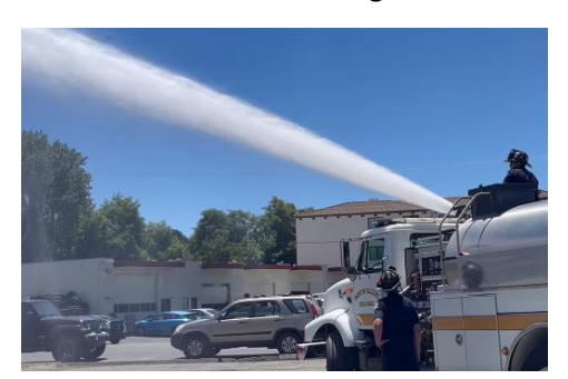
Boys and Girls Club Event