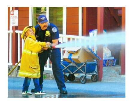
Jacob's Heart Foundation Event