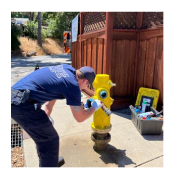
July 14 Hydrant Maintenance